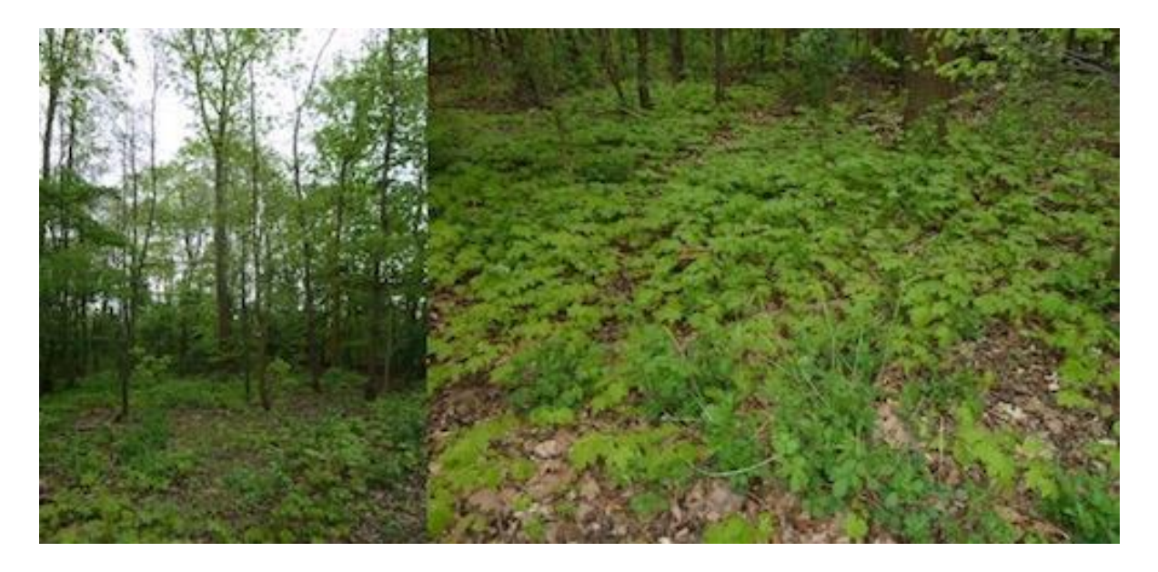
Mostly Acer platanoides tree seedlings in a wood observed for several years and photographed (unretouched), April 29, 2016 by W.-E. L. The undergrowth can, of course, vary widely in different populations and environments as well as in different seasons.

A biologist well versed in population genetics stated his personal opinion on this question as follows: "Using a 50 percent initial allele frequency is cheating -- it is optimal for evolution for several reasons -- but has almost no relevance to reality..."